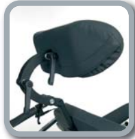
L58 - Adjustable headrest