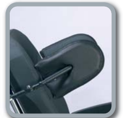
Optional L04 Side supports