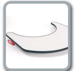
Optional B12 - Table